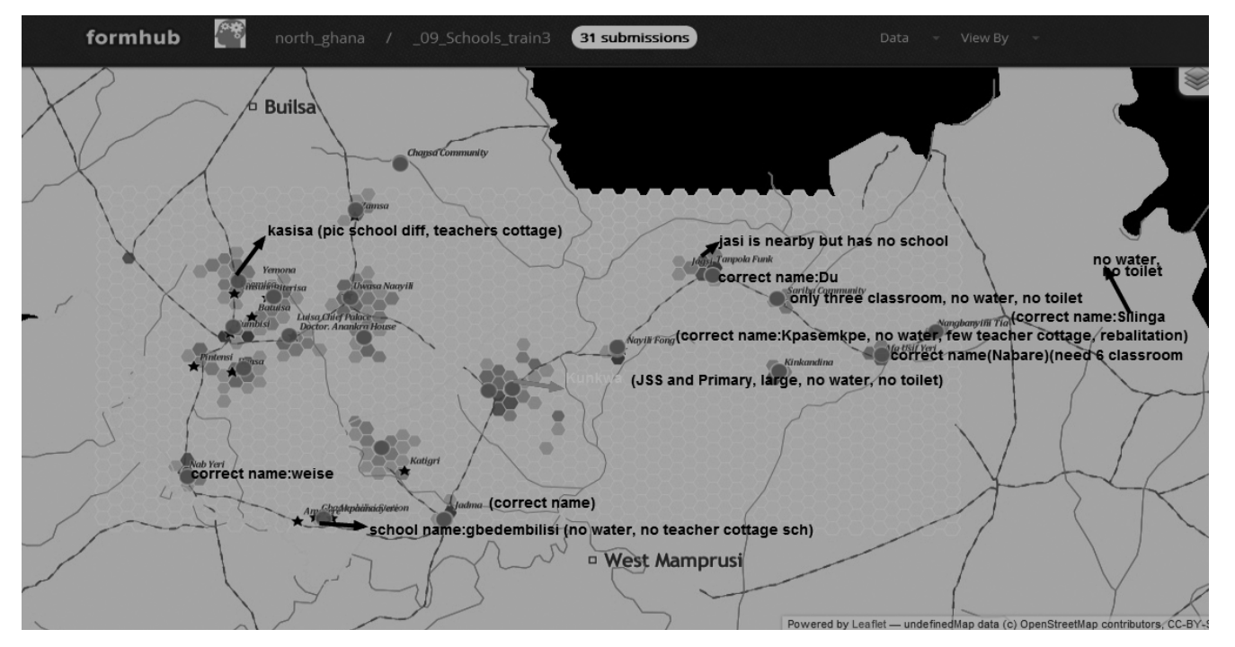
Pictured above is a map of educational institutions. The collection of accurate data can lead to greater accountability, improving important projects such as aid distribution.

Given the high costs and resources required for such data collection efforts, the process is often funded centrally, with the resulting data usually flowing up to and closely guarded by the collecting agency. Donor willingness to fund such initiatives can actually lead to inter-agency competition instead of cooperation, something the authors have unfortunately witnessed in numerous countries. This in turn leads to unnecessary duplication of efforts with identical data being collected, without harmonization, wasting valuable resources that might have been channeled to direct intervention efforts.