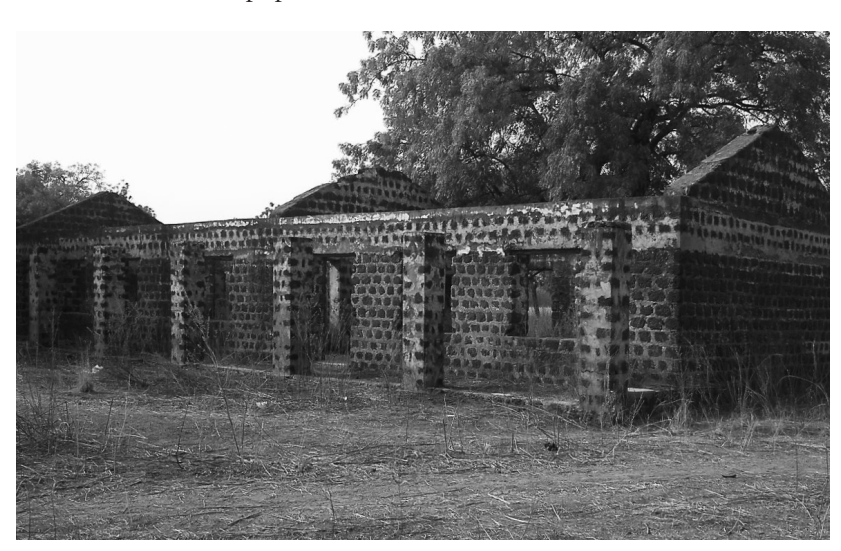
Thanks to mobile technology, any space can become a classroom. Above, this roofless structure exemplifies how a local asset can be transformed into a school.

Government population data is usually demarcated by administrative and political boundaries (states, districts, and voting precincts), which are too disaggregated to enable proper planning at the community level. Proper geospatial planning requires knowledge of the locations and populations of local communities, which is either