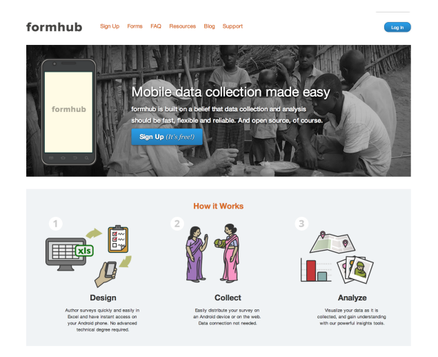
Fig. 8. Formhub.org homepage. The software is open source, and hosted freely for public usage. More than 7,000 users have collected more than 2.6 million individual surveys using the platform.

Second, a series of three major data collection efforts by OSSAP-MDGs led to the creation of the nationwide facility inventory of more than 250,000 health, education and water facilities. The dataset has been integrated into a user-friendly, web-based platform that TAs and LGA officials have been using since 2012. Local and international sector experts drove the survey content to provide detailed essential information for planning purposes, while the CGS focus on the LGA as the funding unit led to a data structure centered around the LGA. As of the time of this publication, the website is intended to be made public, which would make facility-level data available to a wide range of potential end-users from