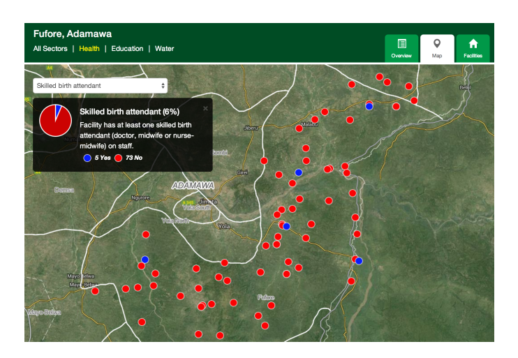
Fig. 5. A map-based visualization of whether or not health facilities have access to Skilled Birth Attendants. Main page navigation omitted.

The information architecture of NMIS is focused around the LGA (Fig. 3). The main content of the website is present in the "Explore Data" section, the first action for which is to choose an LGA to view data in. On the LGA-page, there are two main navigational elements. The first navigational element lets users filter data by sector, including an "All sectors" option which presents a multi-sectoral view. The second element focuses on the way of viewing data, into Overview, Map,