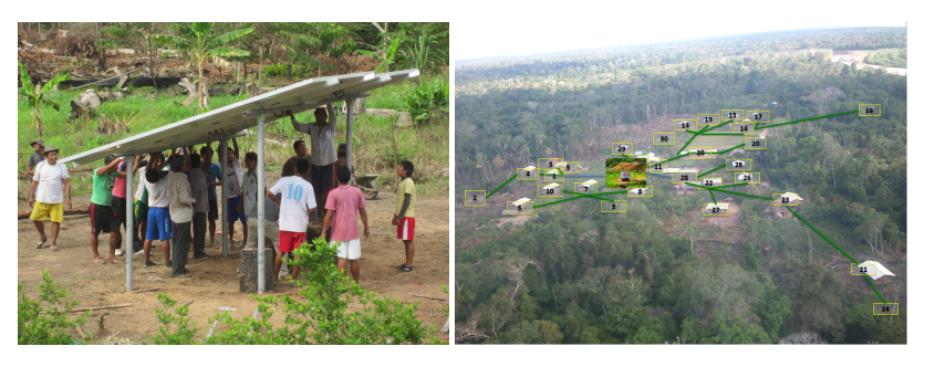
Smart solar micro-grid serves remote, isolated community (Bolivia)

• Digital field surveying. q SEL has been a leader in the use of innovative, digital surveying tools and platforms to help improve the speed and efficiency of data gathering programs as part of the shift away from paper-based surveying. The approach helps planners to combine geo-located demands (residential, social infrastructure), data for grid distribution infrastructure (MV lines and transformers), as well as other geographic information (renewable energy resources, environmentally protected areas).