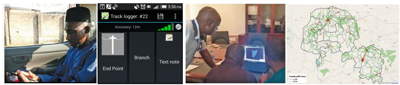
Grid line and equipment mapping (Nigeria)

• Tools and techniques for data gathering and management. Our tools have been used for capturing data in the field for electric grid lines, transformers and other equipment, as well as villages, households, schools and clinics and other social infrastructure. This approach is cost-effective, builds capacity locally, and ensures that datasets can be updated in an ongoing fashion as programs are implemented.