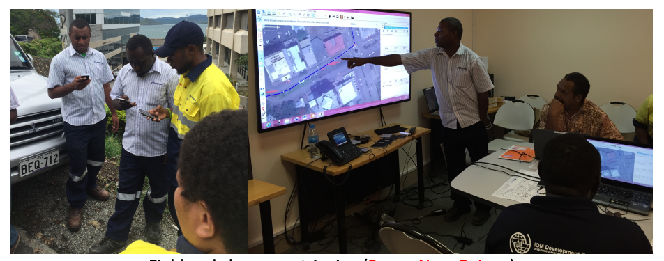
Field and classroom trianing (Papua New Guinea)

• Training is a key part of our approach. We have a deep background and focus on training and capacity building, including support and instruction for all of our tools and methods to localize data, tools and planning.